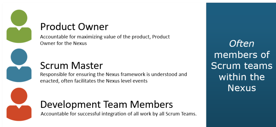
Figure 1. Nexus Integration Team Roles

Nexus is made up of three to nine Scrum Teams working together off of a single Product Backlog to deliver one product. The Product Backlog is ordered and refined by the Product Owner , who is responsible for maximizing the value of the product and the work done by the Nexus. As mentioned in both the Scrum and Nexus Guides, “How this is done may vary widely across organizations, Scrum Teams, and individuals,” however ultimate accountability lies with the Product Owner. The Product Owner is on the Nexus Integration Team, and the services of the Product Owner role are represented on every team in the Nexus. It doesn’t however mean that the Product Owner is working in a vacuum