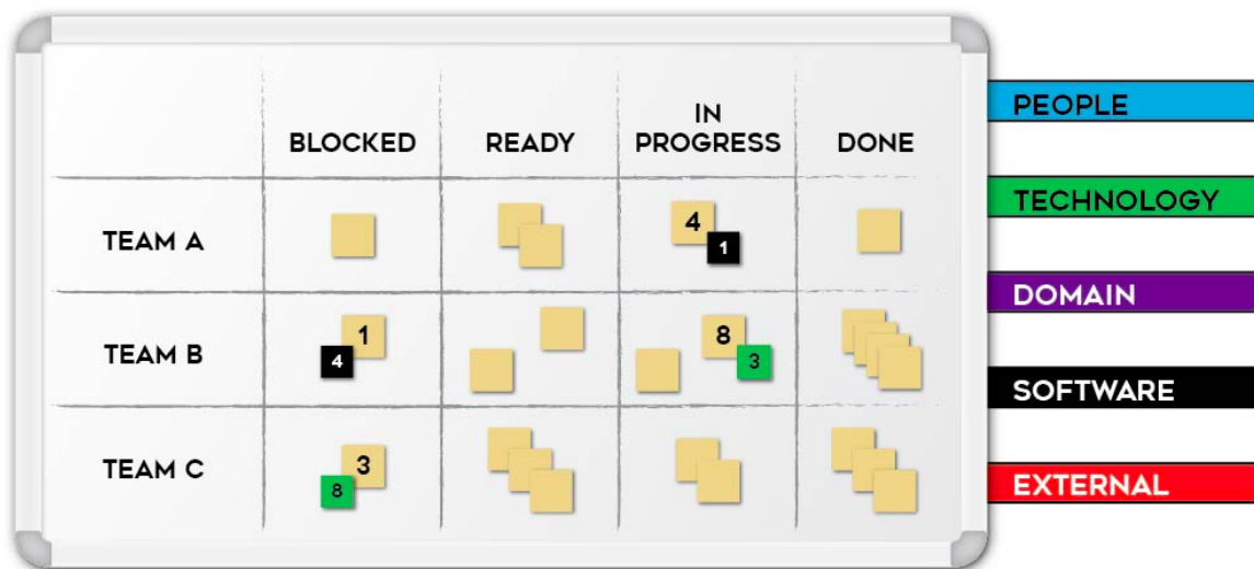
Figure 2. Nexus Sprint Backlog

Figure 2 shows in-Sprint dependencies between the teams during the Sprint. (Figure 1 shows these as vertical dependency arrows in the Sprint +1 column).